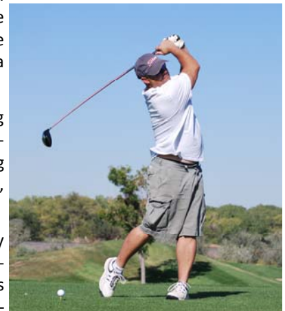
What a great shot!

We encourage you to patronize our donors' businesses and thank them for supporting Parents Reaching Out. We will be looking for you to join us in the fall for our 3 rd year of this fun event. Get your clubs out and start practicing so you will be ready to "Swing to be a PRO."