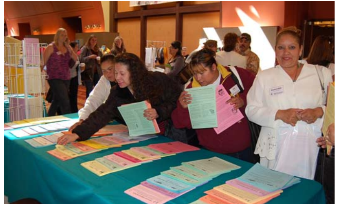
7th Annual Family Leadership Conference participants at the PRO Resource Table

Your $200 donation will sponsor a family for the 2-day 8th Annual Family Leadership Conference!