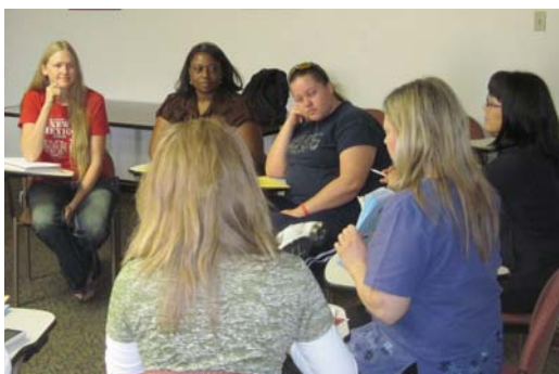
UNM Students in a FAF class session.