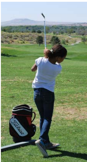
One of our sponsored players